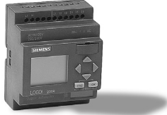
The programmable logic module is the brain of the MVP line of control panels

Orenco's MVP line of control panels is specifically engineered for water and onsite wastewater treatment systems and is especially suited for applications that require a programmable timer. The MVP Simplex Panels are ideal for timed dosing in single pump systems.