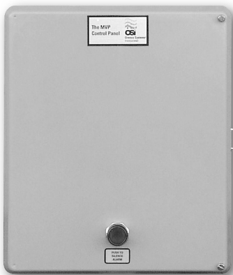
The enclosure is NEMA 4X rated